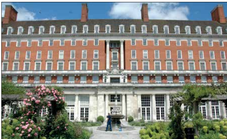
LONDON SQUARE - STAR AND GARTER, RICHMOND HILL

Founded in 2010, London Square seeks to build high-quality residential-led developments to reflect the aspirations of the local communities where we work. We have a proven track record of delivering new homes across the borough of Richmond, including the Star and Garter in Richmond and Waldegrave Road in Teddington.