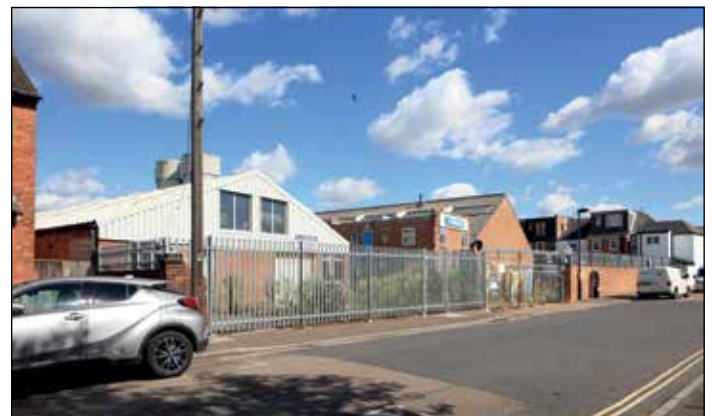
VIEW OF EXISTING GREGGS BAKERY SITE FROM EDWIN ROAD