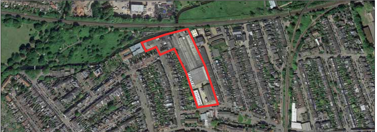
AERIAL VIEW OF EXISTING GREGGS BAKERY SITE