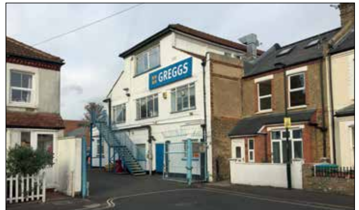
VIEW OF EXISTING GREGGS BAKERY SITE FROM CRANE ROAD

Development Director For and behalf of London Square